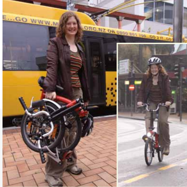
Sweet ride – a folding bike in action in Wellington.